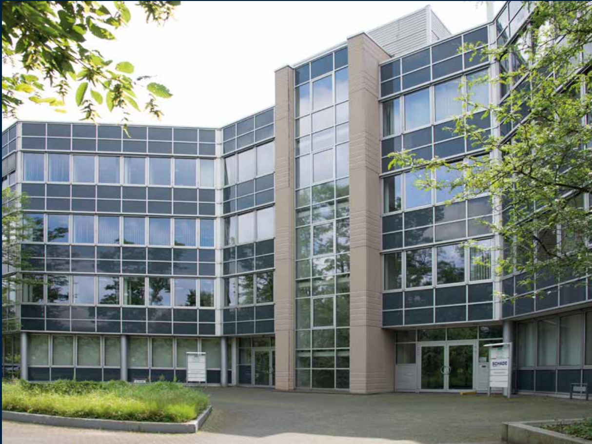
SCHADE Headquarters Gelsenkirchen, Germany