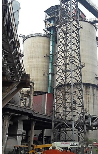
Silo feeding by Bucket Elevator