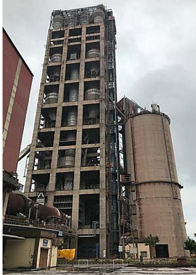
Kiln feeding by Bucket Elevator