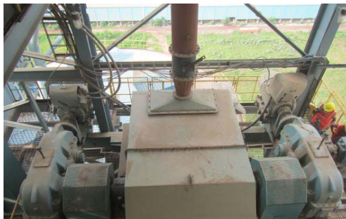
Raw Mill re-circulation by Double Bucket Elevator