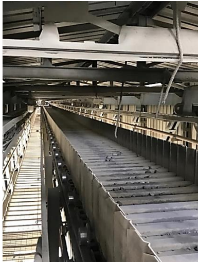
Deep Pan Conveyor below Cooler