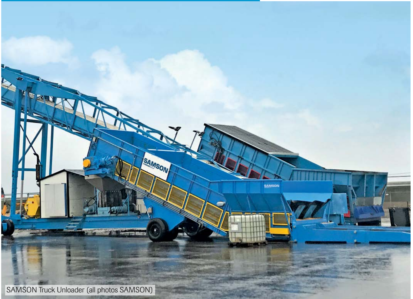
SAMSON Truck Unloader